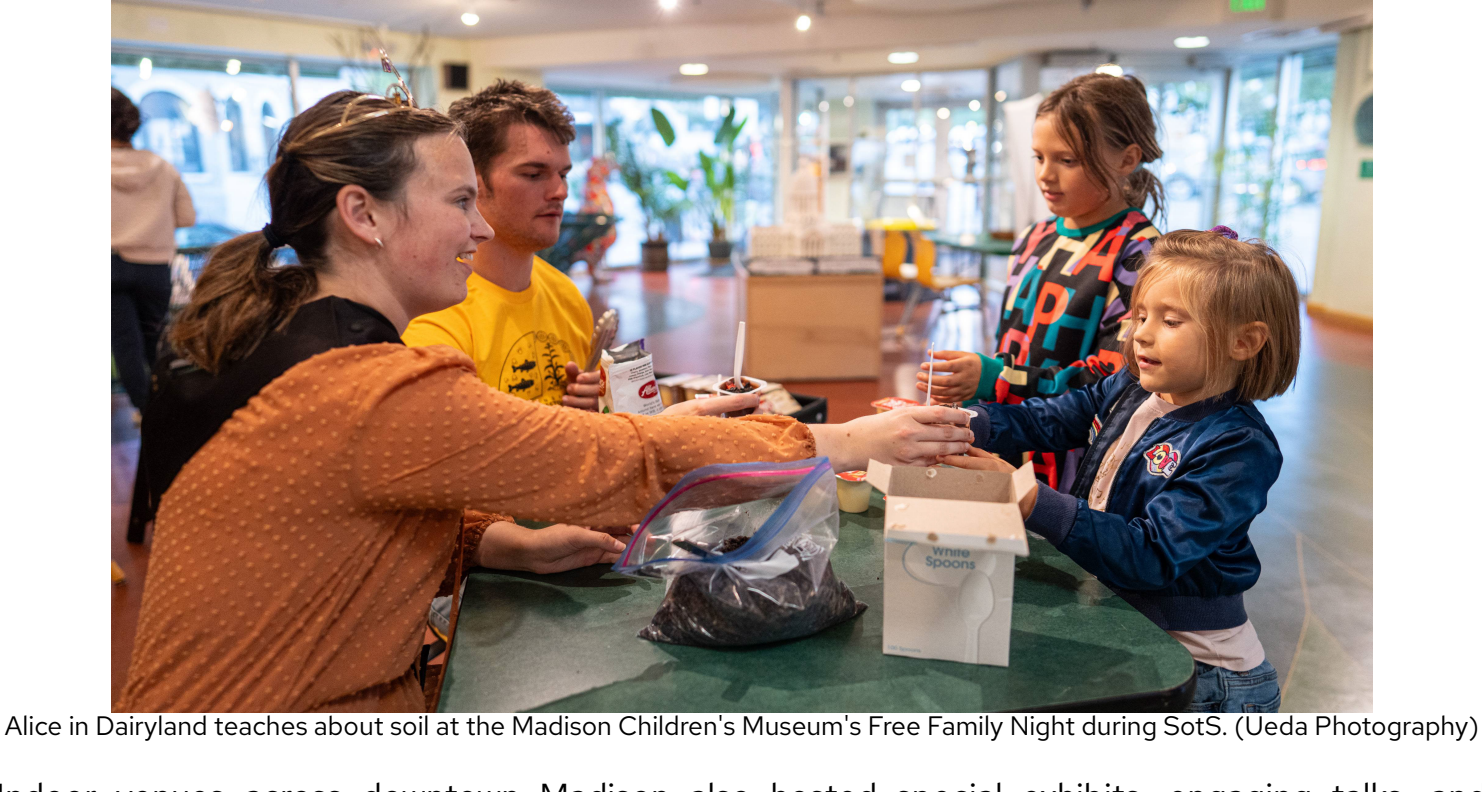
Indoor venues across downtown Madison also hosted special exhibits, engaging talks, and exclusive product or menu specials. It was the perfect opportunity to explore the everyday science

Science on the Square brings science to life right in the heart of downtown Madison - transforming